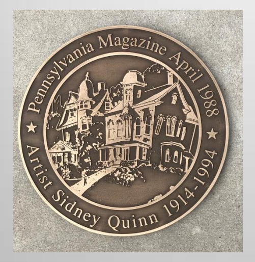
24" Diameter Custom Bronze Sidewalk Medallion $2,100