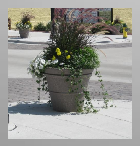
Self-watering Planters $460-$600 Varying Sizes & Styles