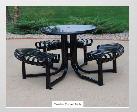
Thomas Steele Carnival Table w/3 curved benches $2,530