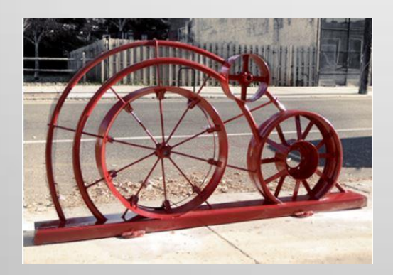
Large Custom Bike Rack e.g. by artist Sandra Weber-King $5,000-$6,000