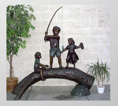
Cast Bronze Open-Stock Sculptures $3,500-$8,000