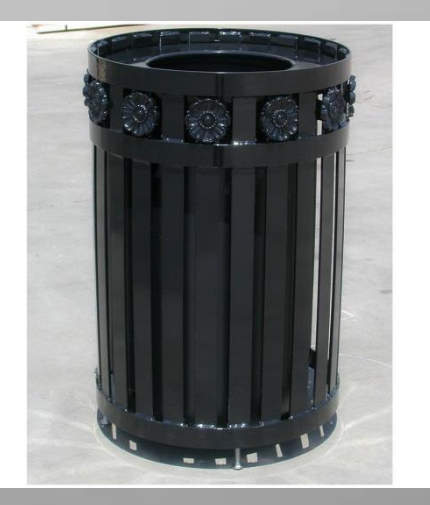
Gramercy Trash Receptacle $830