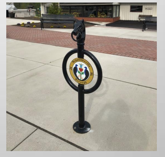
Custom Horse Head Bike Hitching Post $850